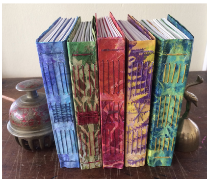
Long Stitch Books