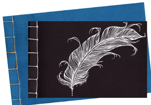
Japanese Stab Bound Books